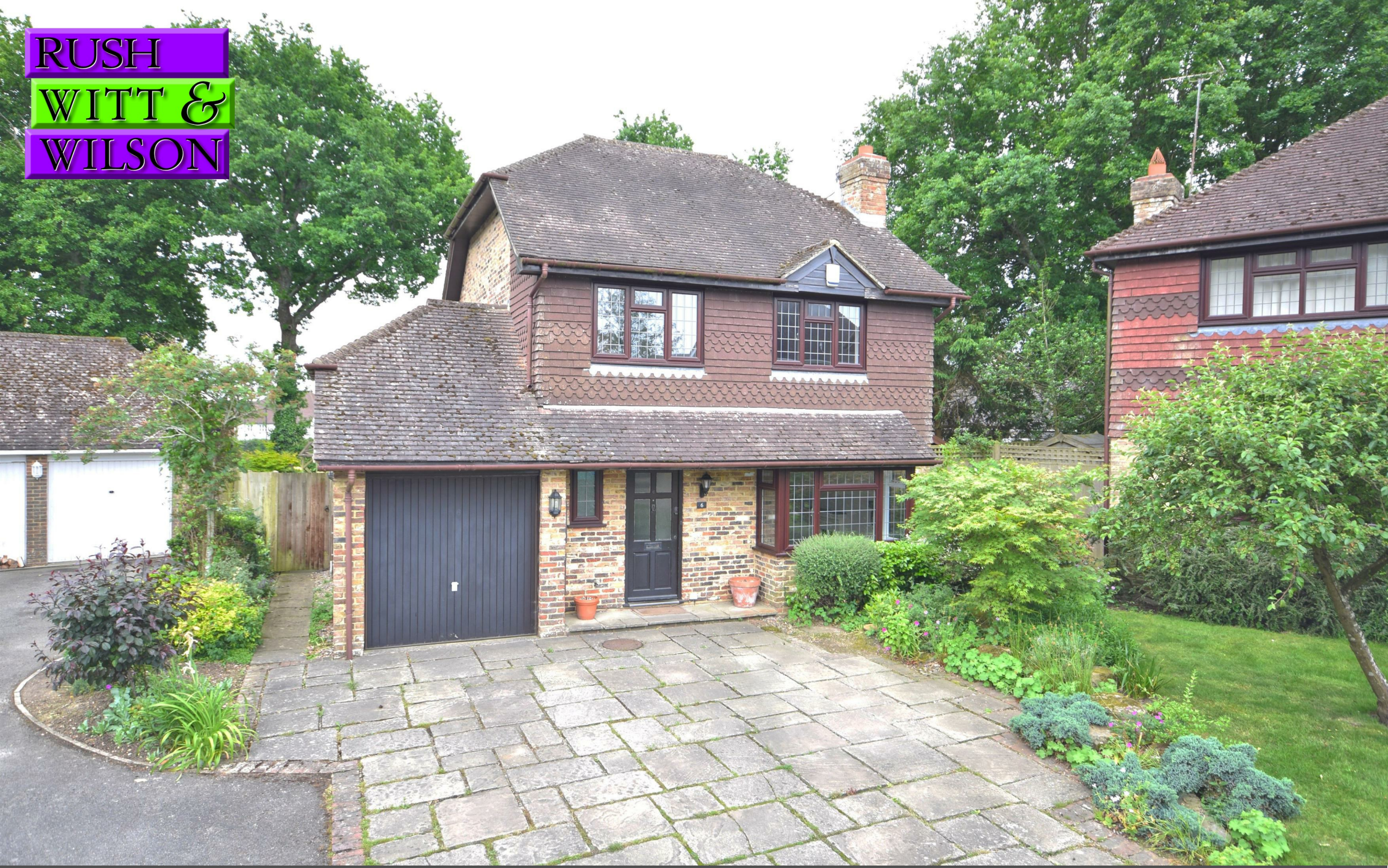
6 Sheringham Close, Staplecross, East Sussex, TN32 5PZ. £535,000 Guide Price.